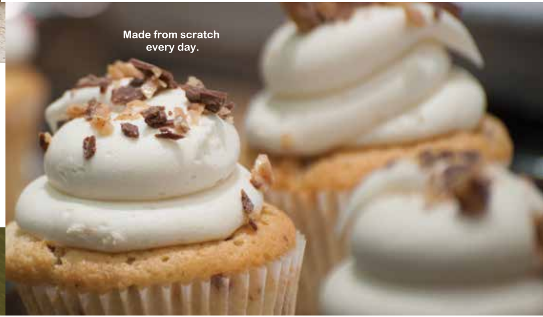
Made from scratch every day.